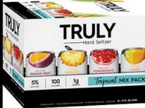
Truly Tropical Variety 12 Pack Cans

Super Cluster is a Citra-Hopped Mega Ale of intergalactic proportions. Everything they’ve learned about making hop-forward beer: Pale, cold, alcoholic, and bitter. Available in 6 pack cans.