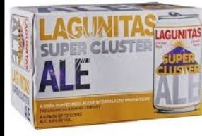
Lagunitas Super Cluster Cans

The beer in this can has achieved what we all hope for ourselves; to be made new again. There is freedom in burning down the house of expectations and it confers an undeniable lightness to being. We didn’t invent these truths; they invented us. At 4% ABV and only 98 calories, Day-Time IPA represents everything they know about making hop-forward beer, expressed in a sotto voice.