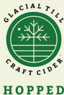
Glacial Till Hopped Cider

Rosalie taps into their brewery’s family winemaking roots, using local wine grapes to create a delicious one-of-a-kind beer rosé with bright fruit flavors and luscious acidity. Rosalie is co-fermented with Chardonnay and other wine grape varieties harvested just miles from the brewery. They also incorporate a dash of hibiscus flower to achieve a brilliant color. The result is Rosalie—a uniquely refreshing beer that offers all the best qualities of a classic rose wine.