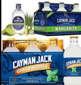
Cayman Jack Margarita and Cuban Mojito

THE GOOD STUFF Styles: Their newest styles: Passion Fruit, Pomegranate, Pineapple and Mango. ABV: 5% Calories: 100 Sugars: 1 g Carbs: 2 g Gluten free