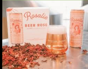
Firestone Walker Rosalie

all designed to showcase the possibilities of pure hop aromas and flavors. The lead hops in No. 12 include varieties from the Pacific Northwest and Germany, providing explosive flavors of tangerine, honeydew and strawberry gummy.