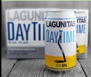
Lagunitas Daytime Cans

Great taste Zero Alcohol. Heineken 0.0 is brewed and fermented with Heineken’s unique A-yeast made with natural ingredients, gentle alcohol removal and blending to achieve a fruity flavor and slight malty notes